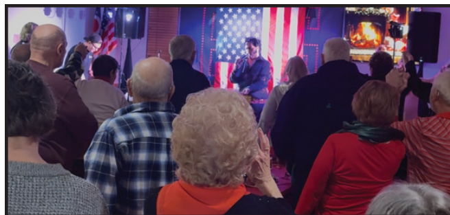
An Evening with Elvis

Please Check our Monthly Calendar for Extra Activities and Bus Trips.